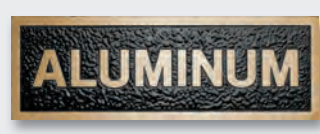
Flash Bronze Interior Applications Only